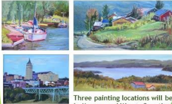
Three painting locations will be in Monroe and Wayne Counties.

Take advantage of the early registration workshop fee!