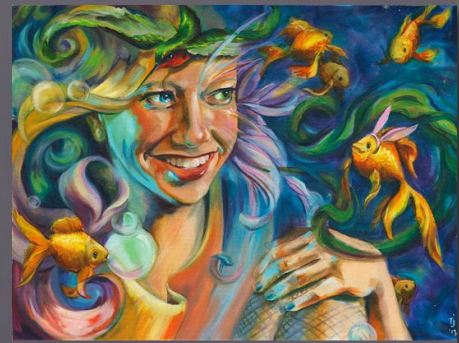
Prismacolor Col-Erase Pencils